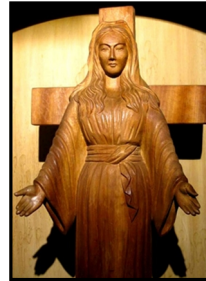
Miraculous statue of Our Lady of all Nations, who wept tears of blood, in Akita

"Without Jesus, Mary tells us, you have no peace, no joy, no future and no eternal life." (message to Marija of July 25, 2010). It is not too late.