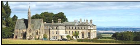
Medjugorje Centre (North East)