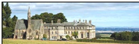
Medjugorje Centre (North East)